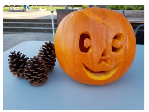
The CAC handed out candy and greeted guests of the Downtown Troutdale Trick-or-Treat Trail