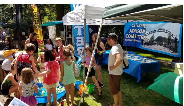
Members of the CAC handed out prizes to game winners during the 2019 SummerFest

Be on the lookout for the CAC at your next Troutdale event, and be sure to come and say \ensuremath{\mathsf{hi}}\xspace!