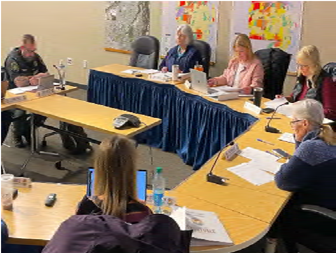
PSEAC meets the first Thursday of every month at 6:30 p.m. in the Kellogg Room at Troutdale Police Community Center.

The Public Safety and Equity Advisory Committee (PSEAC) is a collaborative effort between the City of Troutdale, its residents, and the Multnomah County Sheriff’s Office (MCSO). The committee meets the first Thursday of every