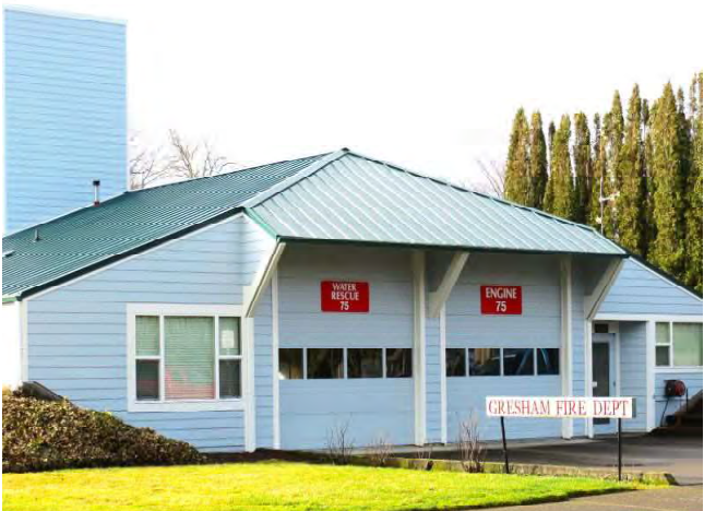
Gresham Fire Station #75, at 600 SW Cherry Park Road

Over the next 18 months your City Council is going to be working hard to come up with the best way to ensure that we are protected, and also have a say in how that service is provided. Please reach out to City staff, or your City Council, if you have any questions or concerns.