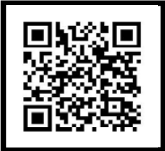
(Click QR code to visit the PSEAC web page.)

Public attendance and comment at committee meetings are encouraged. Agendas, minutes and audio of previous meetings are available online.